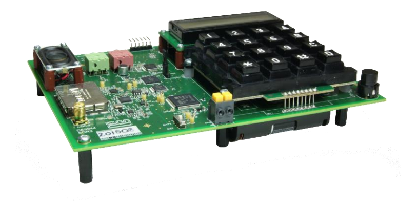
Figure 3: DE9944 SDR FDMA Radio demonstrator